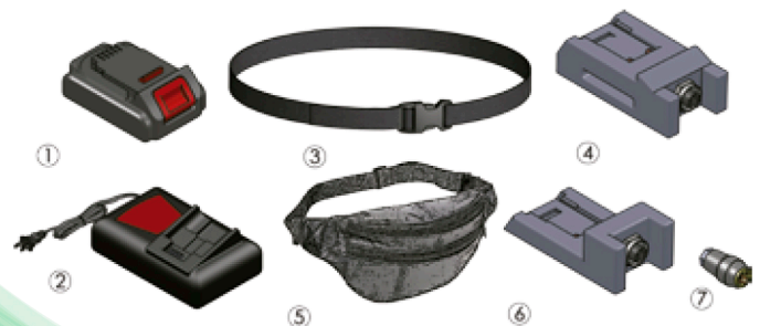
SAMPLE BATTERY PACK DISSECTION MODEL