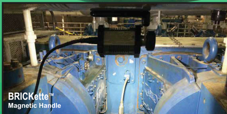
BRICKette™ Magnetic Handle